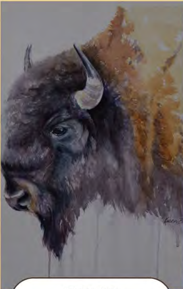
MEDORA BISON