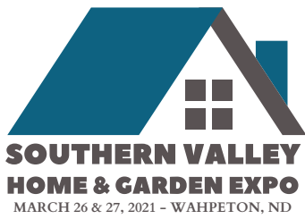
EXHIBIT SPACE APPLICATION

2022 Southern Valley Home & Garden Expo March 26-27, 2022 - Saturday 9 - 6 & Sunday 11-5 Held at the Clair T. Blikre Activities Center - NDSCS