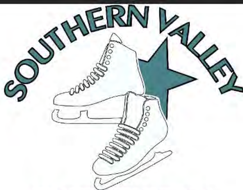
FIGURE SKATING CLUB

Learn to skate program for all ages and levels of skaters!